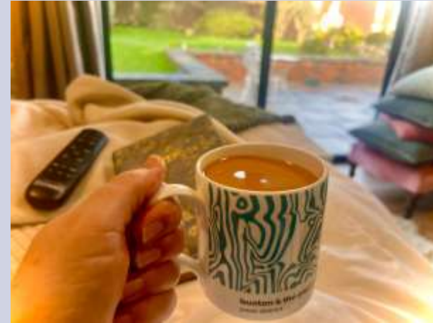
A cup of Yorkshire Tea