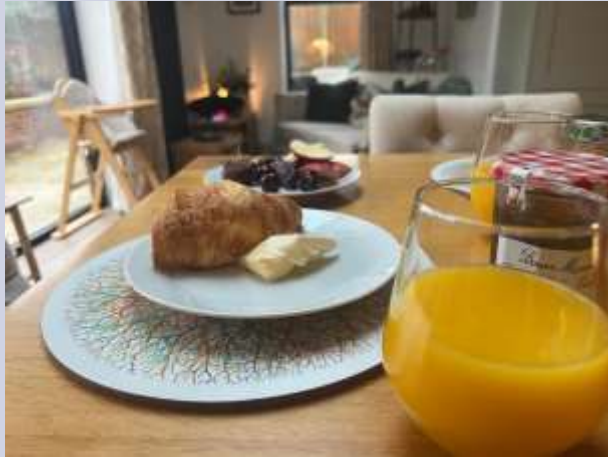
A delicious breakfast in the morning