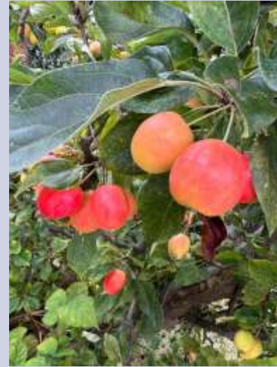
Apples growing on the trees