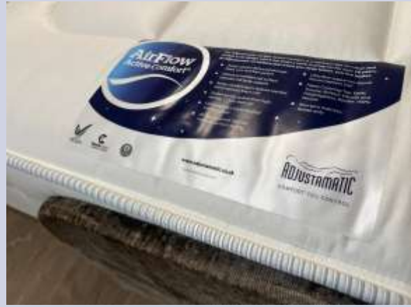
The comfortable Adjustamatic beds