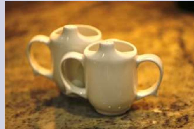
My favourite drink in the Easy-Grip cups