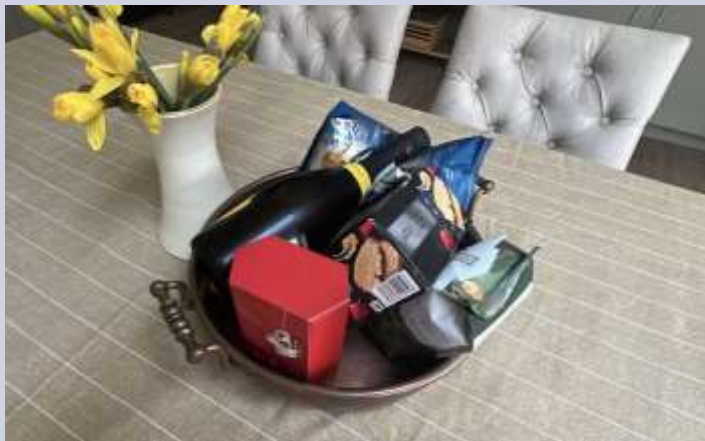
Tasty Welcome Treats from the owners