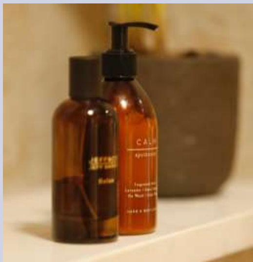
Soap products in the shower