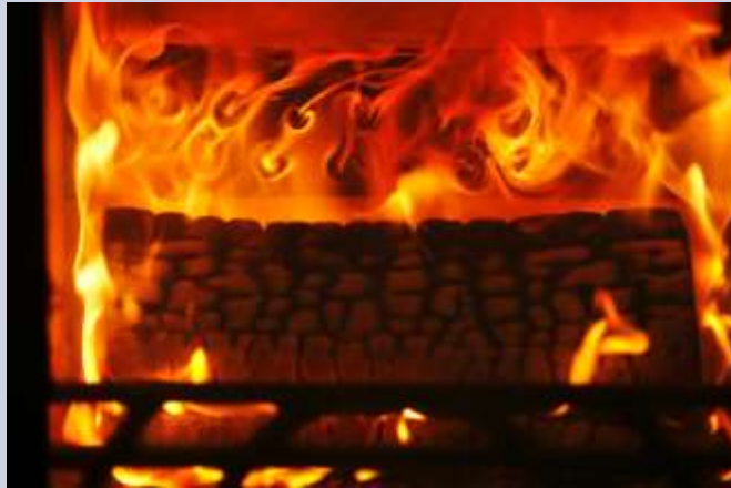
The flames of the log fire