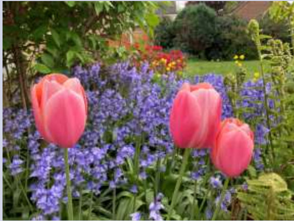
Flowers in the garden