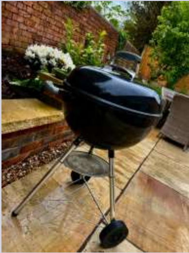
Food cooking on the barbeque outside