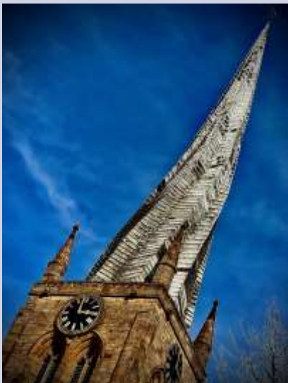
The famous Crooked Church Spire