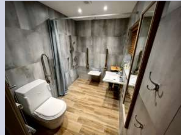
The accessible bathroom