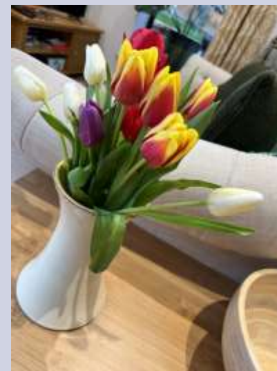
Fresh flowers on the table