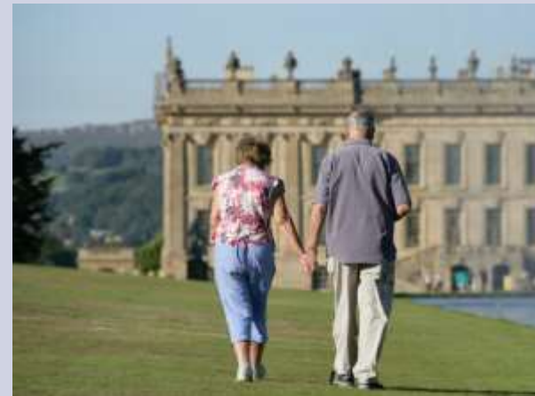
Fantastic accessible attractions nearby