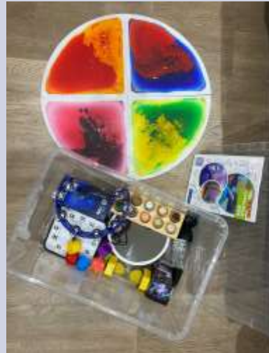
The Sensory Toys