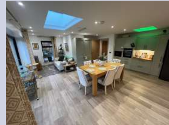
Meals being prepared in the kitchen