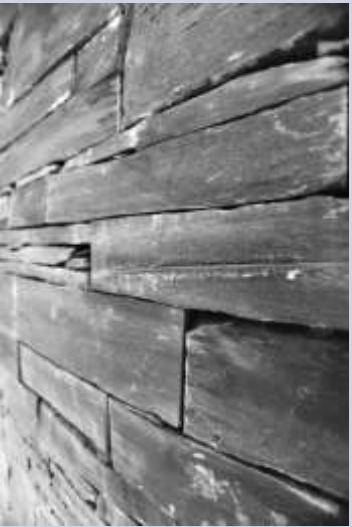
The slate stone of the fireplace