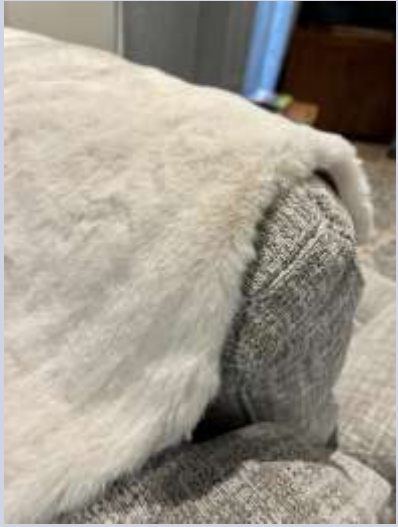
The soft, cosy blankets