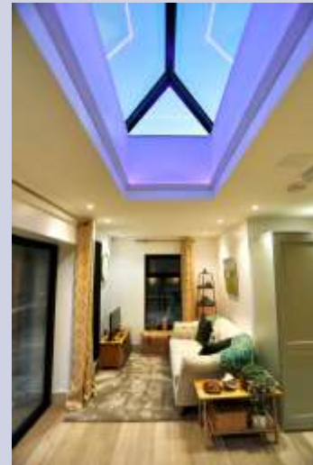
The clouds through the skylight